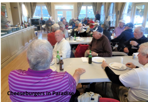
Cheeseburgers in Paradise