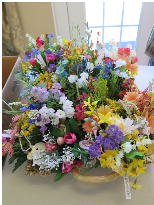
Silk flower arrangements for the Lakes of Litchfield