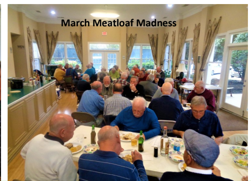
March Meatloaf Madness